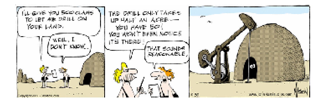
Inside this issue: Marcellus Shale, Marcellus Shale, Marcellus Shale!