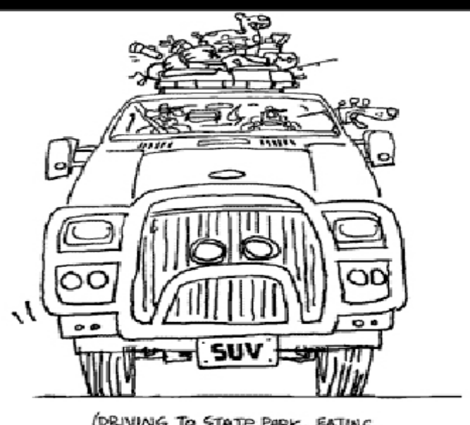
(DRIVING TO STATE PARK. FATING BURGERS AND FRENCH FRIES.)